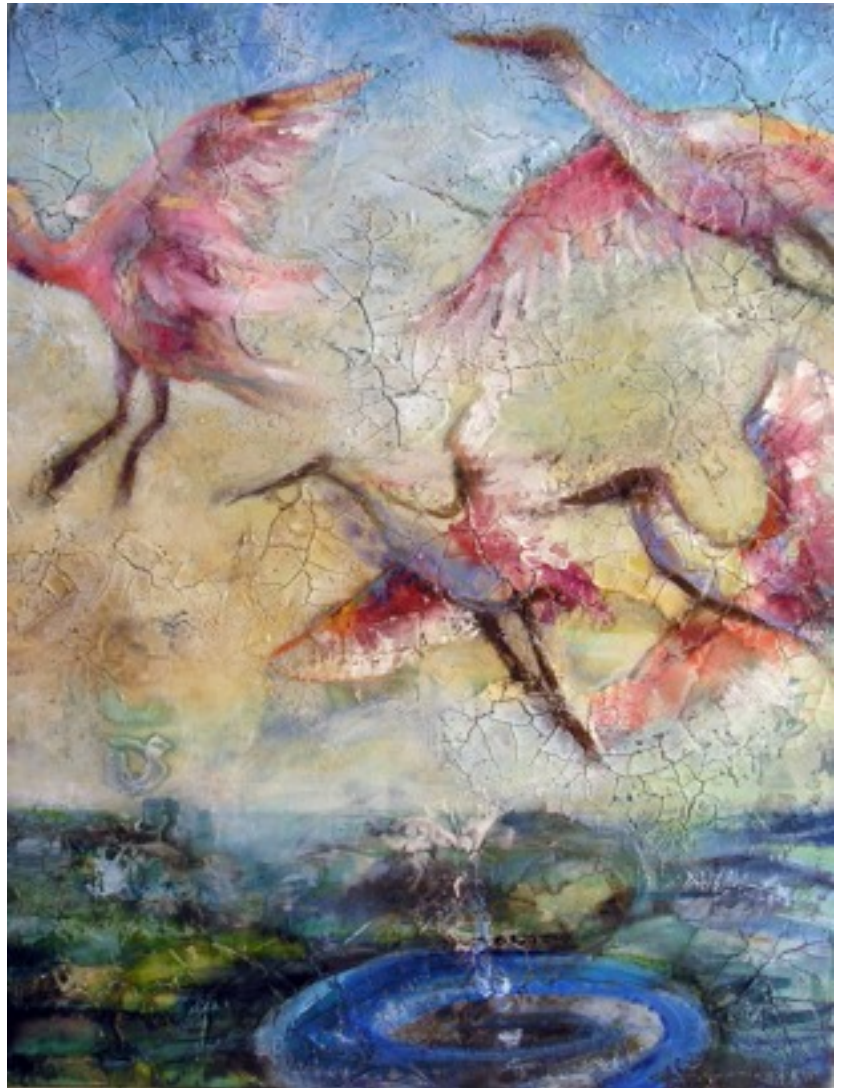
Acqua by Nancy Renner

A number of other courses beginning in October still have openings; check the WILL website.